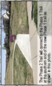
The Phase 2 Trail will connect to the Phase 1 Trail at the southern end of the new Phase 1 trail as shown in this photo.