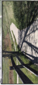
The non-ADA compliant pedestrian connection to the Eaglecrest HS parking lot will be rebuilt to current accessibility standards as part of this project.