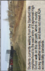
Students currently walking from the Stanford Hills neighborhood to the east entry of Eaglecrest High School walk on this dirt path, which is muddy during wetter events, and does not meet ADA accessibility standards.