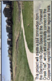
This project will create a trail connection from the Stanford Hills Open Space to the Unimaded Hillside neighborhood, connecting to the Copperleaf neighborhood, & to other regional trails.